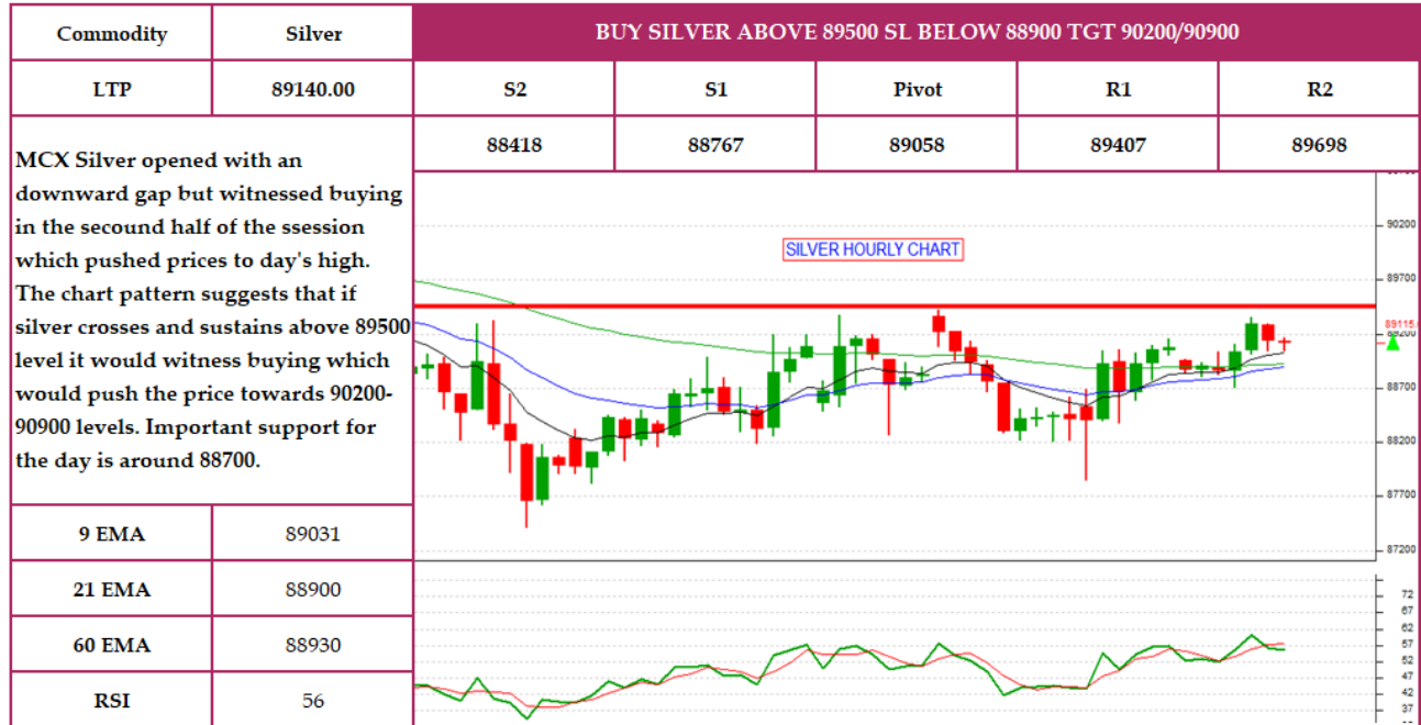
Chart for the day